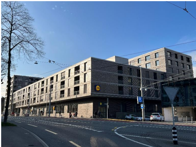
Caption: New living space in an excellent location.